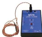
Liquid Level Alarm