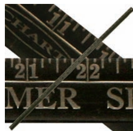
Liquid Level Measuring Stick