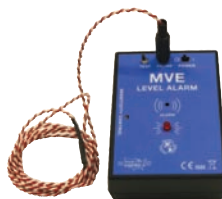
Liquid Level Alarm