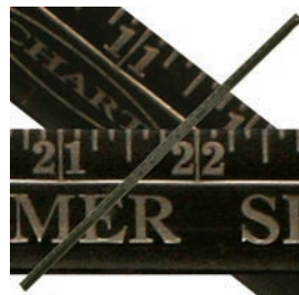
Liquid Level Measuring Stick