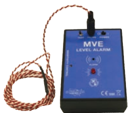
Liquid Level Alarm